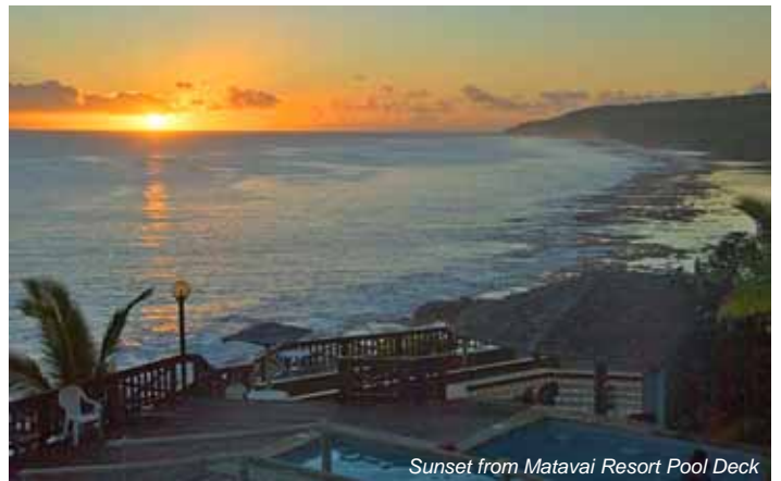
Sunset from Matavi Resort Pool Deck

The Namukulu Motel is situated just 10 minutes drive from Alofi. The 3 individual, self contained bungalows are set amongst tropical vegetation with magnificent panoramic sea views and only minutes away from the natural reef pools. Each bungalow sleeps up to 4 people and offers a large living room, kitchenette and bathroom with modern appliances including fridge and cooking facilities. Each unit has a generous sized deck area outside on which you can relax and enjoy a drink while watching the spectacular sunsets or whales breaching just off shore. Each bungalow features a fridge, microwave, gas hob, ceiling fans, radio, TV and insect screens. The resort offers a freshwater swimming pool, whale watch look out, BBQ area, laundry, home gym, small library and free internet access.