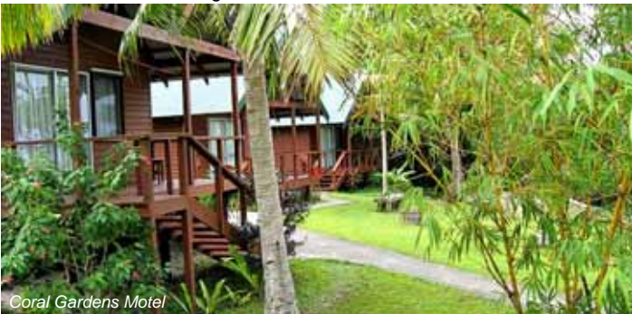
Coral Gardens Motel

Coral Gardens Motel is located a 6km north of Alofi and offers 5 comfortable studio type, self contained fale with cliff top ocean views. Each self catering fale has an individual patio, screened windows, ceiling and floor fans, fridge, TV, radio and spacious private bathroom. All fale have been designed with your privacy, peace and comfort in mind, providing a relaxing atmosphere for those wanting to escape. Take a dip in the natural cave on site and then head to the Sails Bar for a selection of cool drinks and snacks. The Sails Bar is open 7 days a week and the resort also offers free use of portable BBQ's and wireless internet access, as well as stunning ocean views.